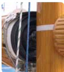
Faux Spruce Finish