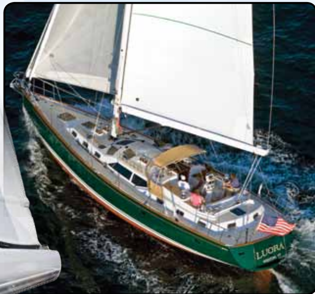
TARTAN 5300 WITH CARBON FIBER BOOM

Nearly 4,000 systems in use, making ocean passages all over the world in all sea conditions. Leisure Furl is a highly efficient, safe and simple method of reefing and controlling the mainsail. The Forespar Leisure Furl is developed, marketed and built by a spar builder of the highest reputation. We have been building spars in the U.S. for over 40 years.