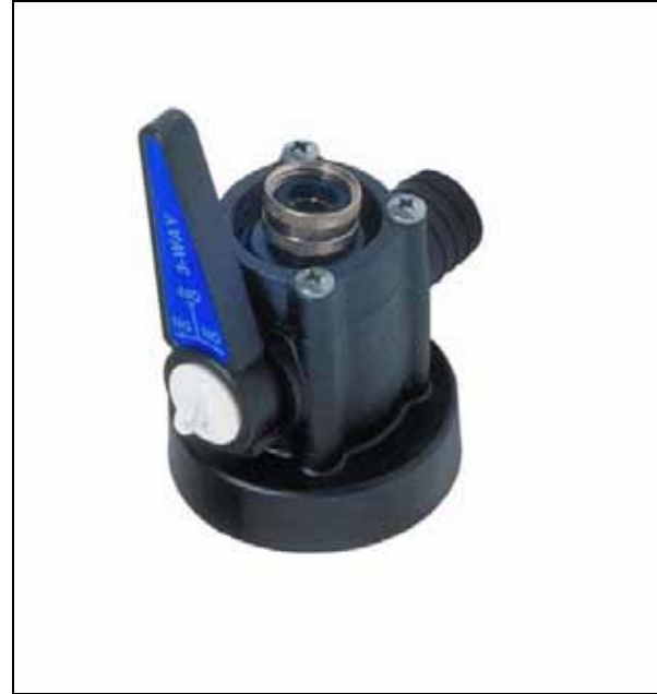
Flush out valve with garden hose top