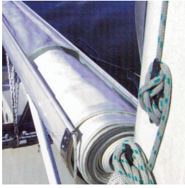
Built-in sail cover protects mainsail from harmful ultraviolet sun rays.