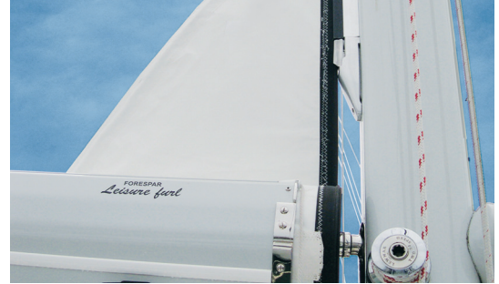
UHMW-PE (Ultra-High Molecular Weight-Polyethylene Luff Track with articulating aluminum feeder).