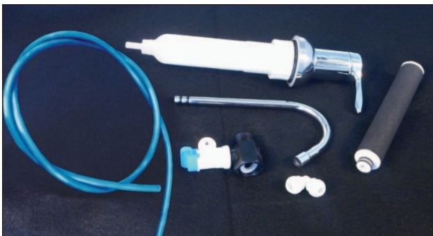
The All-In-One Clean Water Kit includes parts and instructions making installation easy.