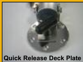
Quick Release Deck Plate