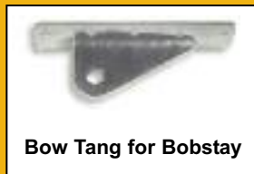
Bow Tang for Bobstay

The Banana Sprit comes in 2 sizes, one for boats up to 40ft and another for boats up to 50ft in length.