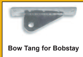
Bow Tang for Bobstay

The Banana Sprit comes in 2 sizes, one for boats up to 40ft and another for boats up to 50ft in length.