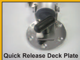
Quick Release Deck Plate