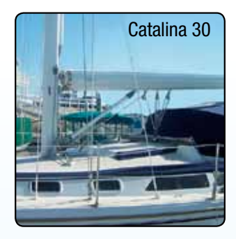
Hand Crafted Boom

Each boom is custom made at our Southern California headquarters by professional riggers. The boom is tapered for refined styling and weight savings.