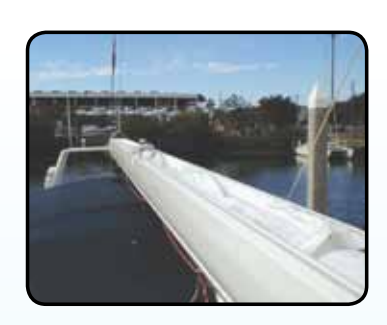
Built-in Sail Cover

Each Leisure Furl ™ boom comes standard with a built-in sail cover for convenience and ease of handling. The Sunbrella® sail cover protects the sail from the harmful elements.