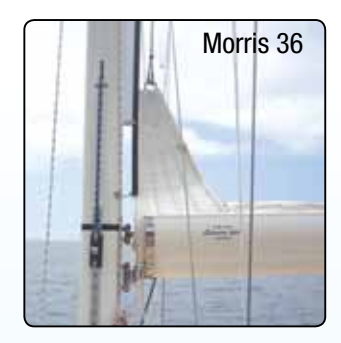
Luff System Leisure Furl ™ uses high modulus PVC luff track.