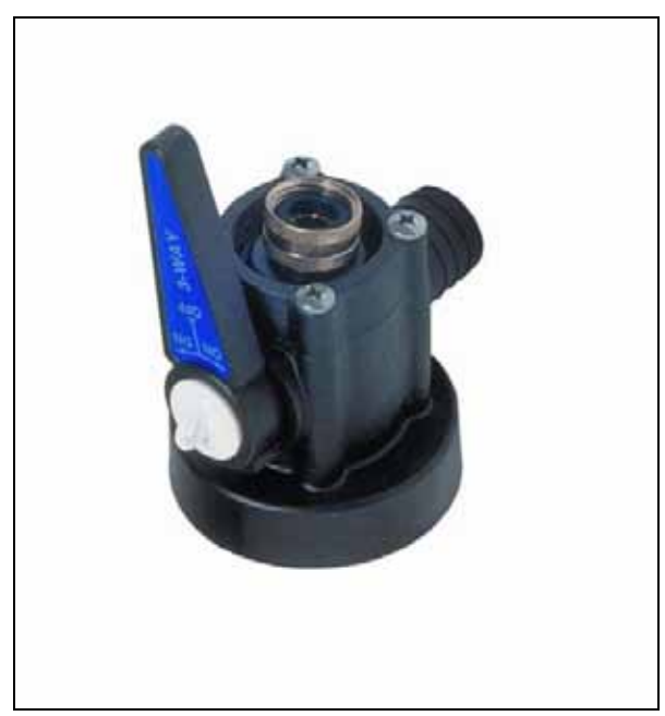
Flush out valve with garden hose top