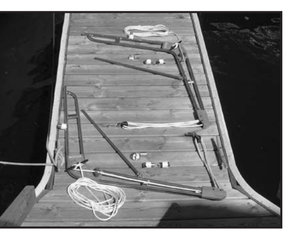
Shipped as complete kit, no extra parts needed for assembly.