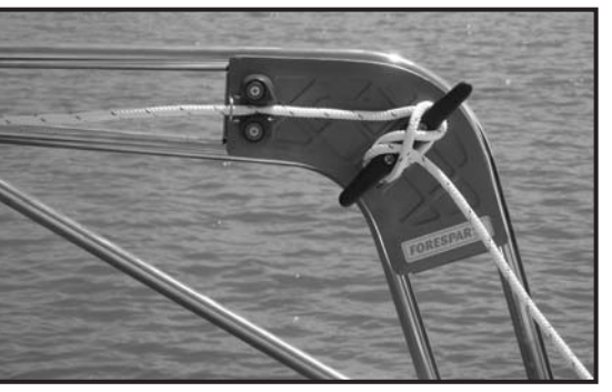
Double Cleat for Safety

We have spent considerable time in building and assessing various designs to suit these requirements.