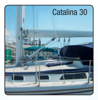
Hand Crafted Boom

Each boom is custom made at our Southern California headquarters by professional riggers. The boom is tapered for refined styling and weight savings.