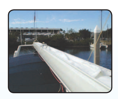
Built-in Sail Cover

Each Leisure Furl ™ boom comes standard with a built-in sail cover for convenience and ease of handling. The Sunbrella® sail cover protects the sail from the harmful elements.