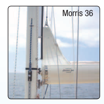
Luff System Leisure Furl ™ uses high modulus PVC luff track.