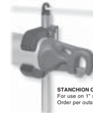
STANCHION CHOCK For use on 1" standard stanchion. Order per outside pole dia.

The pole should be kept level at all times. To accomplish this there will need to be multiple or adjustable mast attachment fittings (track & cars) on the mast except for small day-sailors with a single jib inventory.