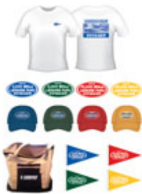
Prize Samples for all Categories